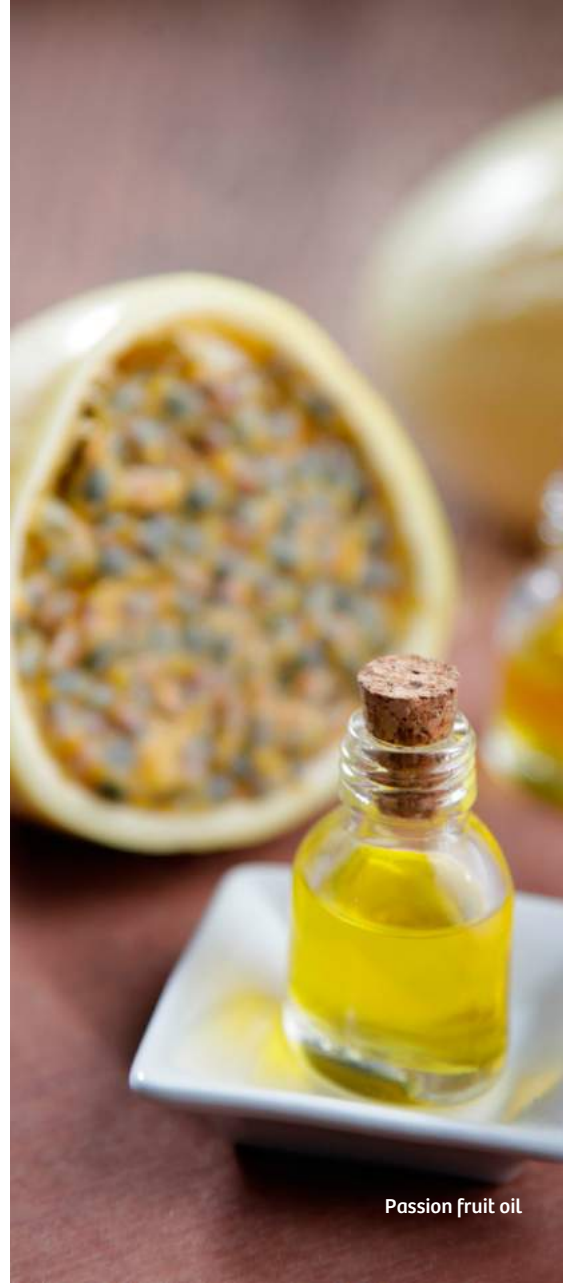
Passion fruit oil

Tara gum (Caesalpinia Spinosa Gum). 100% vegetable thickening and texture agent. htp@derbiotec.com www.derbiotec.com