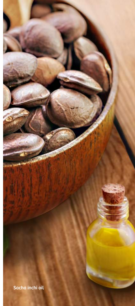
Sacha inchi oil

Discover the exclusive collection of Peruvian products for personal grooming and cosmetics.